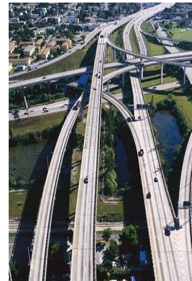
Goals / effect